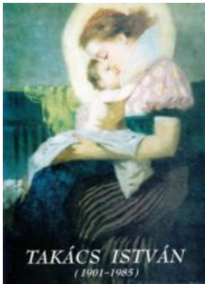
Matyó Madonna (cover page)