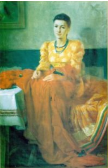
Matyó girl in red shawl /95×143 cm, oil on canvas /