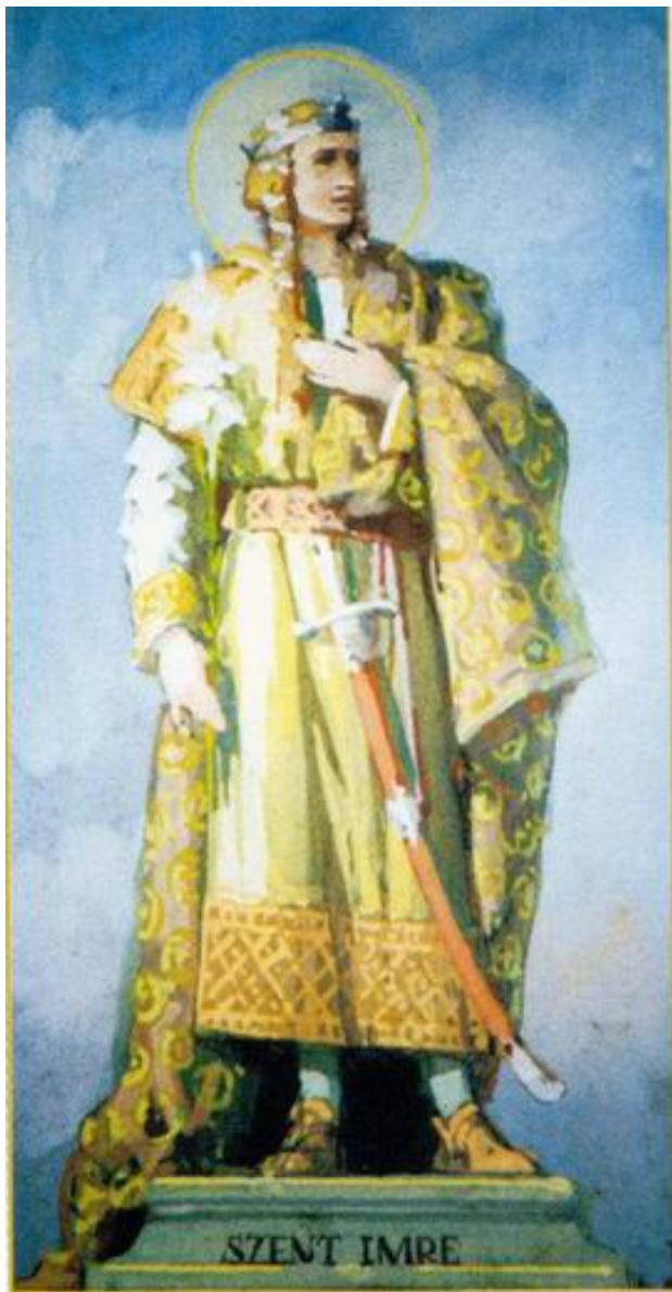
Saint Imre (colour sketch) /13×28 cm,, tempera, cardboard/