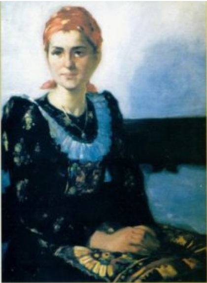
Matyó Bride wearing head scarf /60×80 cm,oil on canvas