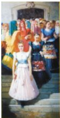
On the way from Sunday Mass /75×150 cm, oil on canvas /