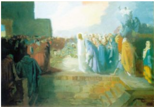
Miracle of Jesus /100×70 cm, oil on canvas /