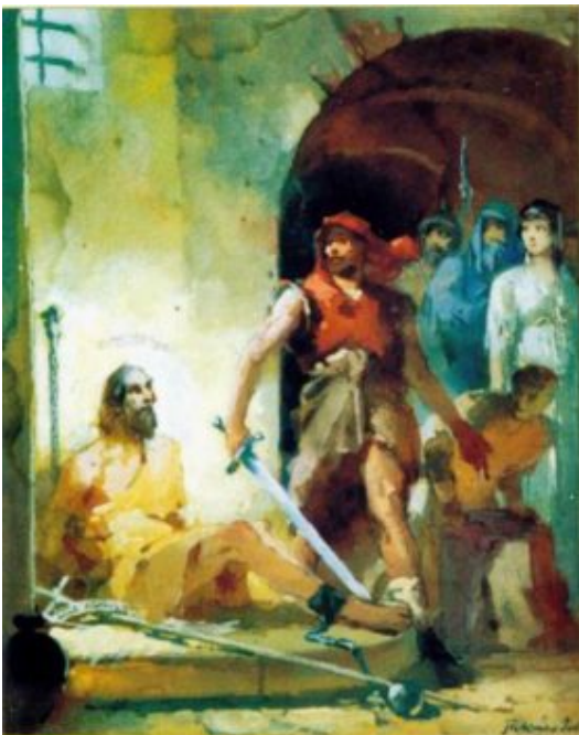
Saint John the baptist in jail /18×22 cm, tempera, cardboard/