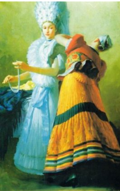
Dressing up the Bride /120×170 cm,oil on canvas /