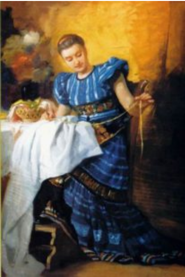
Girl embroidering /40×60 cm, laminated plate, oil/