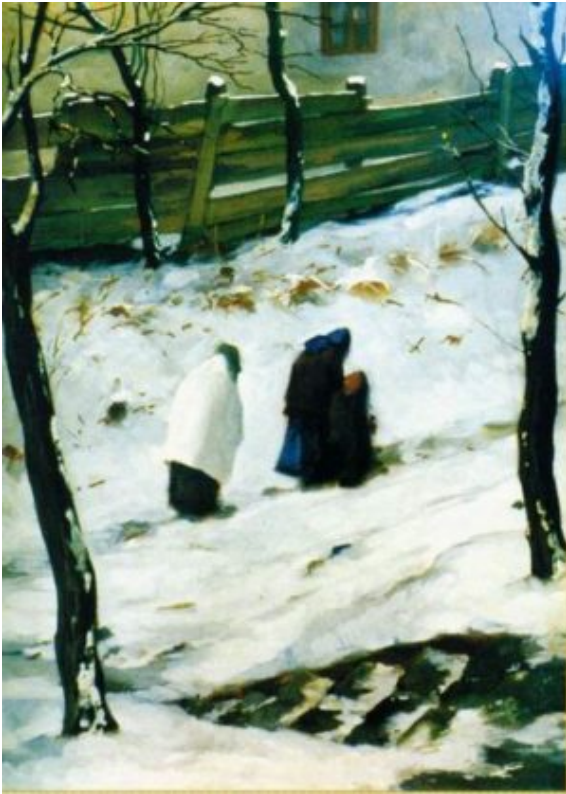
Street in winter /50×70 cm, oil on canvas /