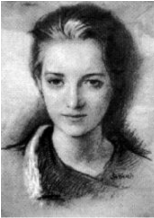
Drawing of his Wife