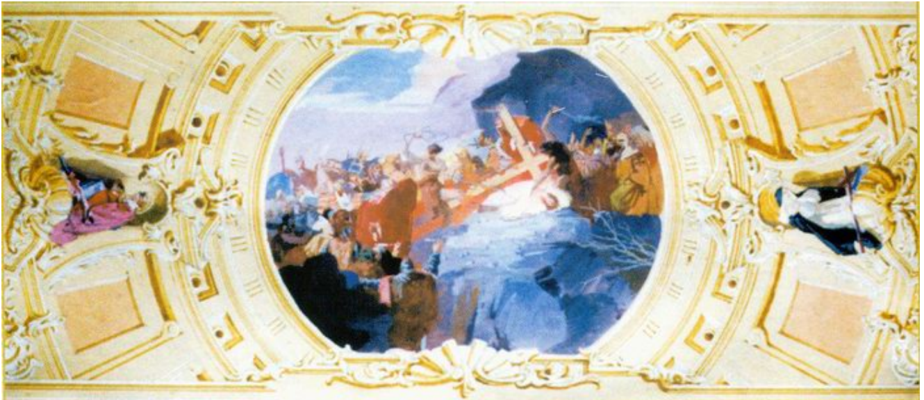
Plan designed to the Saint Anne Church in Miskolc /63×20 cm,tempera, cardboard /