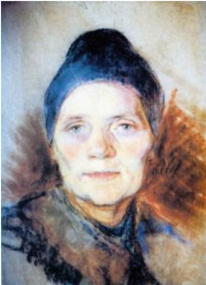
Drawing of his mother /27,5×38,5, pastel, paper/