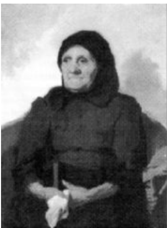
Portrait of his Mother (oil painting)