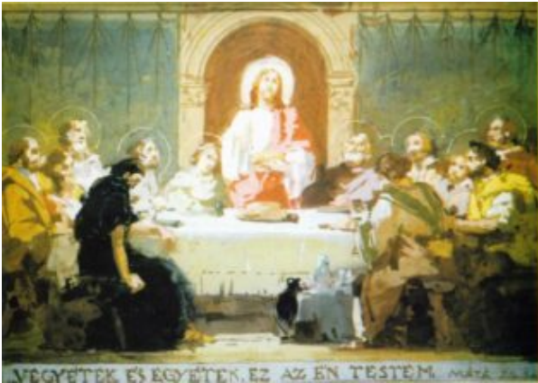
The Last Supper (colour sketch) /30×22 cm, tempera, paper/