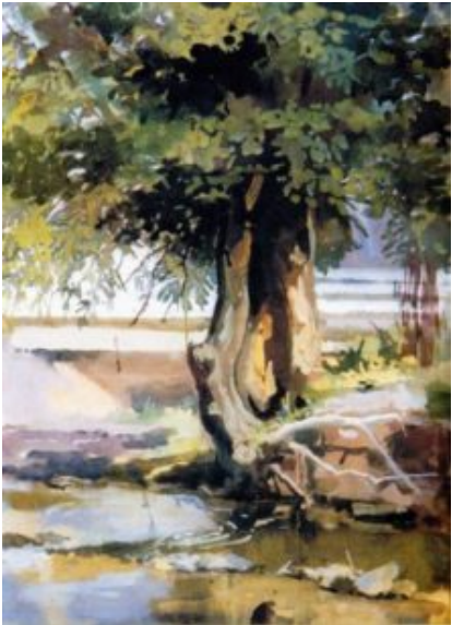
Boom by the water /30×40 cm, tempera, cardboard/