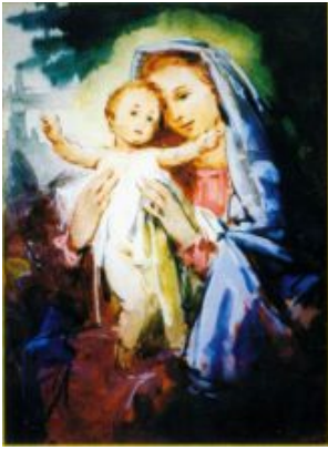
Madonna (colour sketch) /14,5×10,5 cm, aquarell, tempera, paper/