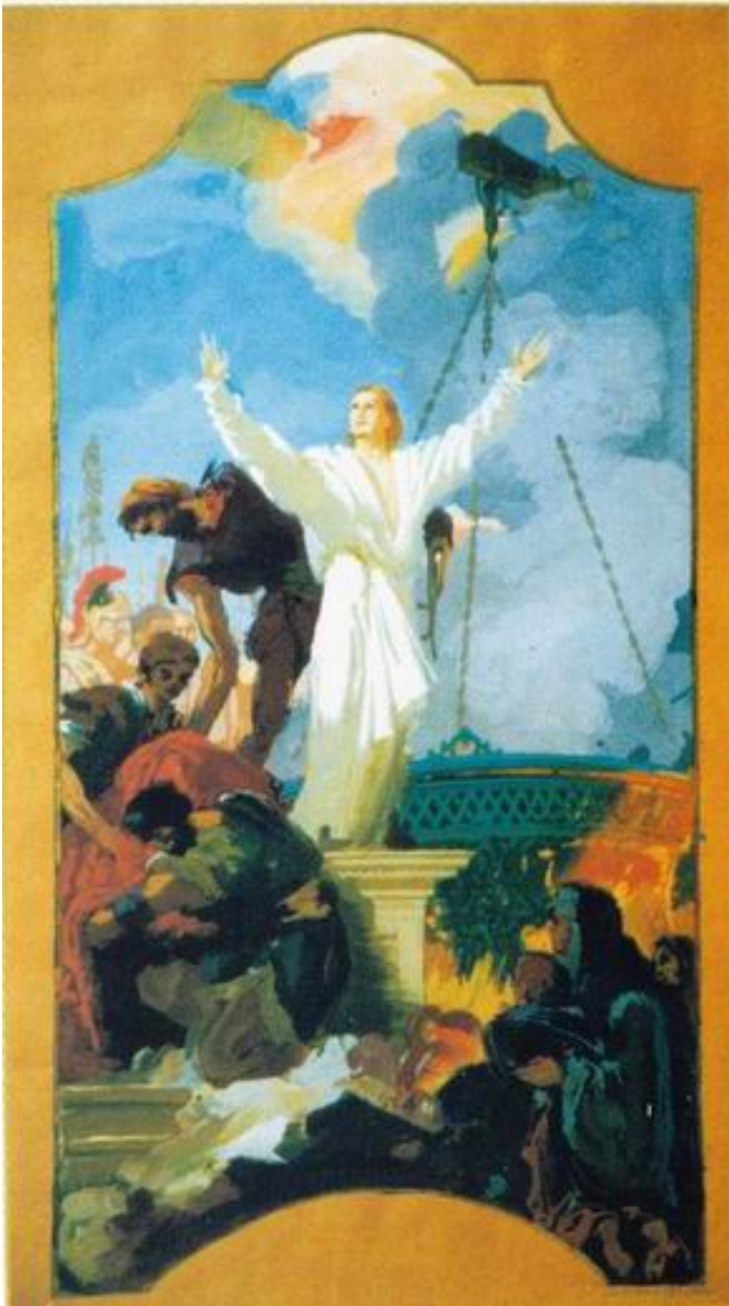
St. John boiled in oil (colour sketch) /20×50 cm,tempera, cardboard/